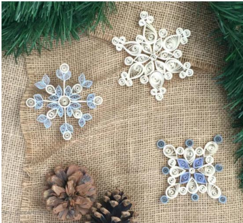
Snowflakes #4, 3 and 2, left to right

Use the measurement guide for your chosen snowflake and assemble the lengths of paper needed. (Note: Your strips are 15 inches. It's okay to use 15 and 7.5 lengths instead of 16 and 8 inches.) Make sure you have enough strips in the accent colors (blue, gray, silver edge) if you choose to use them. Make the shapes in the inner "layer" and assemble as shown in the video, adding each subsequent layer after the glue dries.